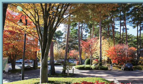
The beautiful garden by their office is very well kept by workers, voluntarily.

Needless to say the finest quality of products, continuous efforts to realize their own philosophy is also the reason why we, MUSO have decided to introduce their ORGANIC KANTEN FLAKES to the world.